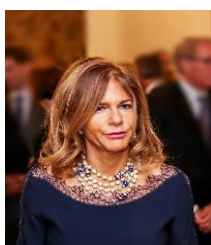
Emma Marcegaglia Chair B20 Italy

We encourage the G20 Leaders to support the concrete recommendations set out in this paper as part of their priorities, in order to improve access to trade finance for all firms as a powerful enabler to support a sustainable and inclusive economic recovery at global level. The COVID-19 pandemic has posed challenges that require G20 leaders to lend their support to breakthrough efficiency proposals and policies that fast-track growth, job creation and inclusion, by preserving international partnerships, by building trust and helping to legitimize companies in accessing external markets, resulting in more stable income and faster recovery for the economy. The proposals in this paper can also be piloted domestically, progressing towards a broad acceptance worldwide.